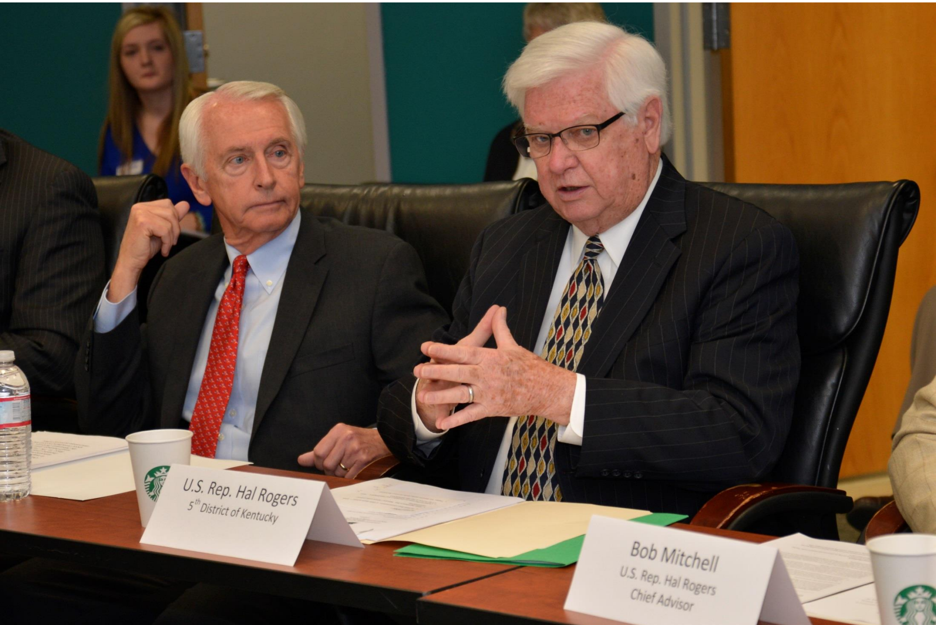
U.S. Rep. Hal Rogers 5 th District of Kentucky