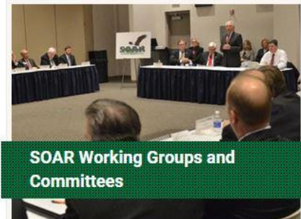
SOAR Working Groups and Committees