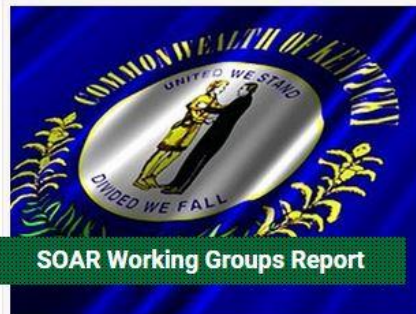
SOAR Working Groups Report